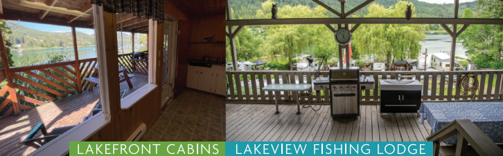
LAKEFRONT CABINS LAKEVIEW FISHING LODGE

Boat, Fish, Paddle, Play, Sunbathe, Swim and Relax